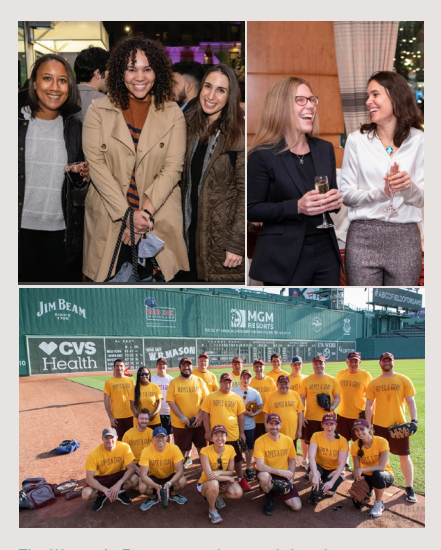
The Women's Forum organizes social and professional development activities.

Through each of these groups, the firm hosts speakers and events recognizing heritage months and other celebrations of identity, as well as a range of educational, professional development and networking programs. At these events, firm leaders and industry experts share insights on topics ranging from networking and mentoring to strategies for career development. Other programs have included receptions for summer associates and welcome events for first-year associates, book signings and author lectures, film screenings, and alumni panels.