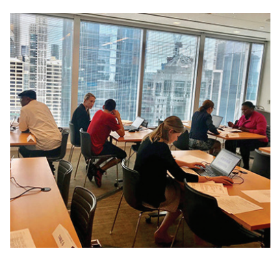
Our Chicago office hosted a record-sealing and expungement clinic.

The Safer Foundation is one of the nonprofits backed by the Neighborhood Jobs Connection initiative, and one of the nation's largest nonprofit providers of services