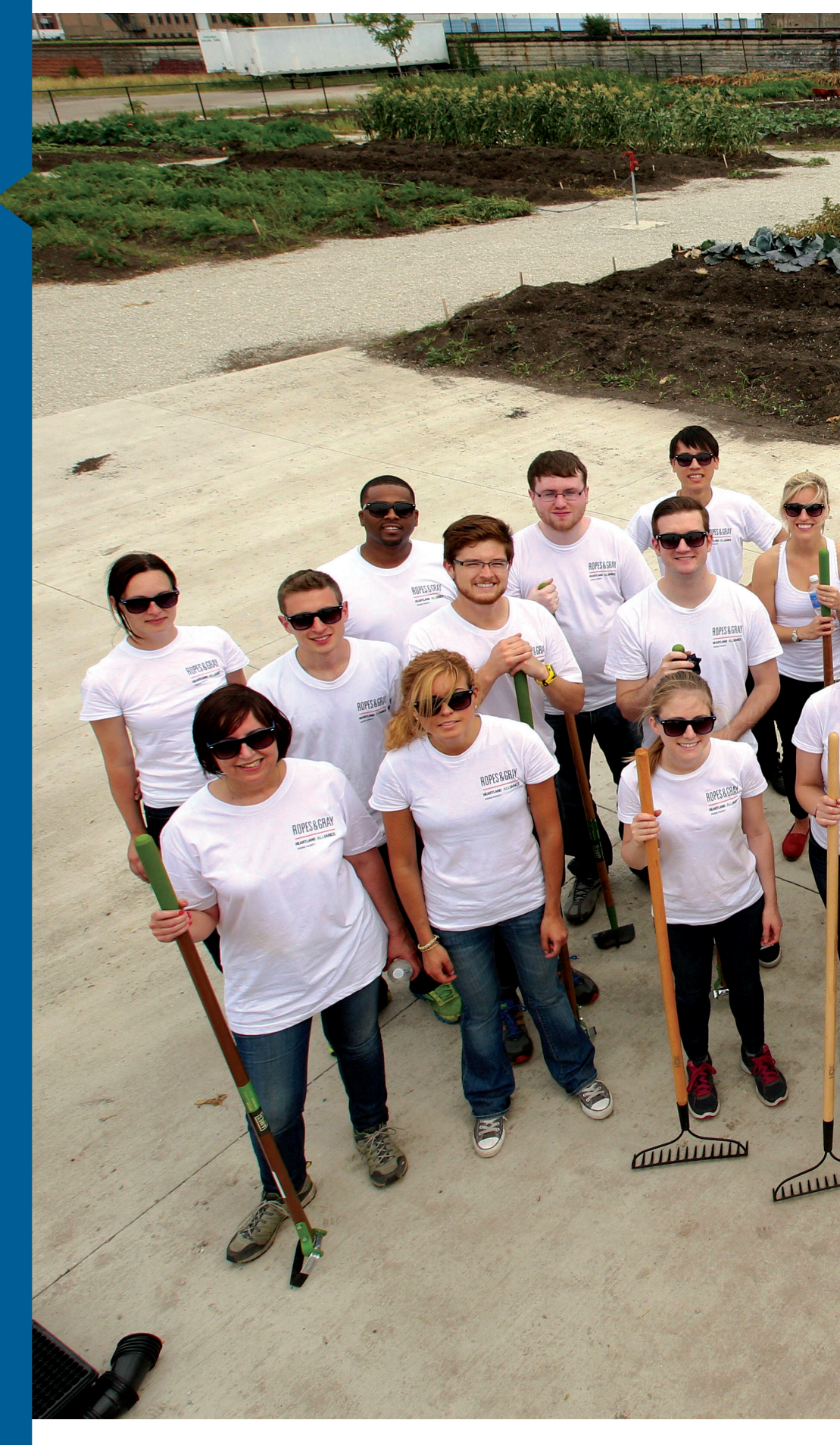
A Ropes & Gray volunteer team in Chicago contributed farm labor to Heartland Alliance's FarmWorks program—one of the many ways the firm strengthens bonds between attorneys and support team members both in and out of the office.