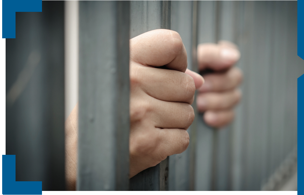
Ropes & Gray served as counsel in a case to end inmate abuse at Rikers Island.