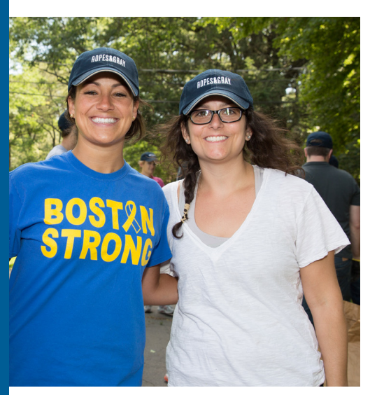
Ropes & Gray lawyers and support team members volunteered to help maintain parks and nature preserves in many of our communities.