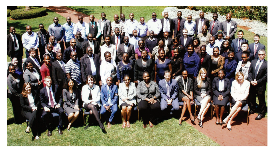
A training seminar organized by Lawyers Without Borders in Kenya.

A team of Ropes & Gray attorneys returned to Kenya in 2020 to continue this vital work.